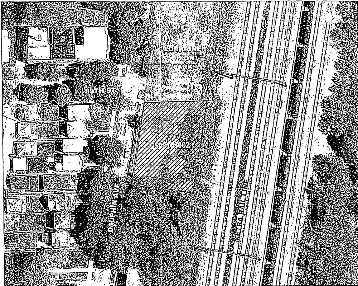
Enhanced Aerial Photograph