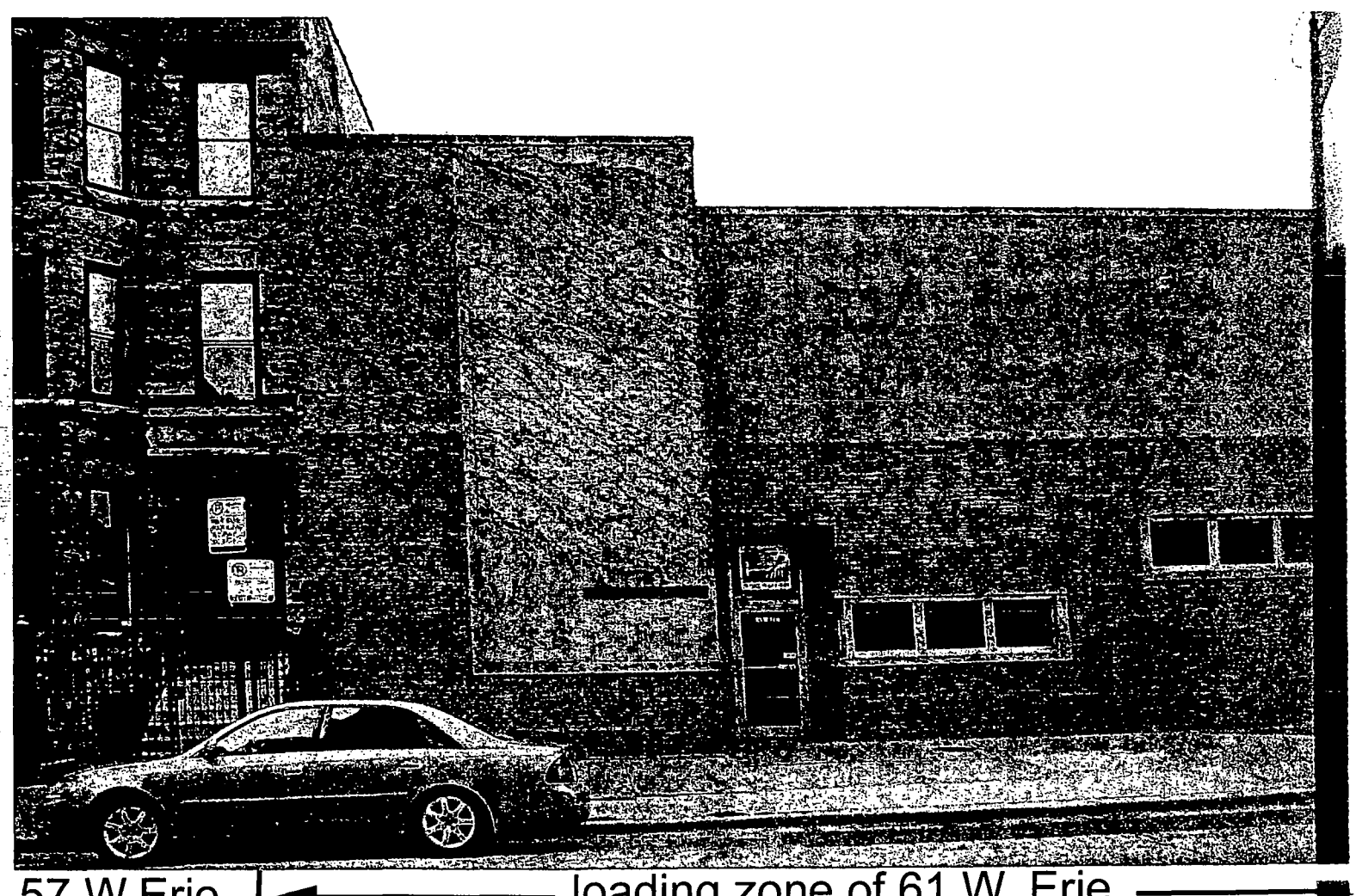
loading zone of 61 W. Erie 57.W.Erie