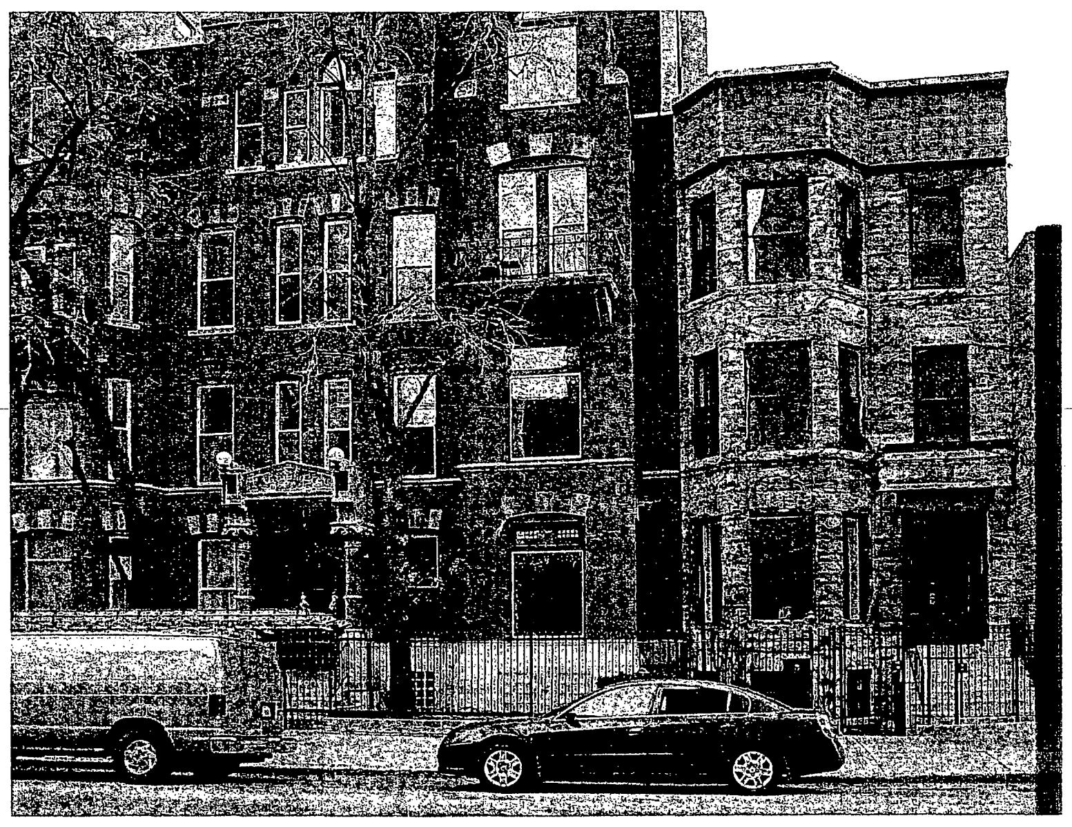
55 W. Erie