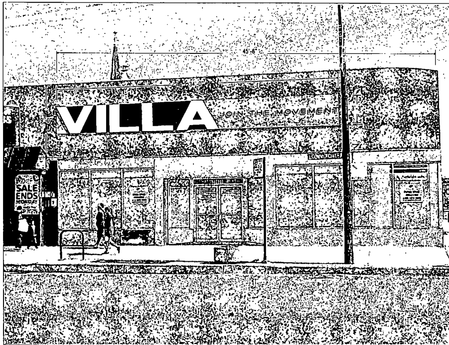
proposed signage Scale: NTS