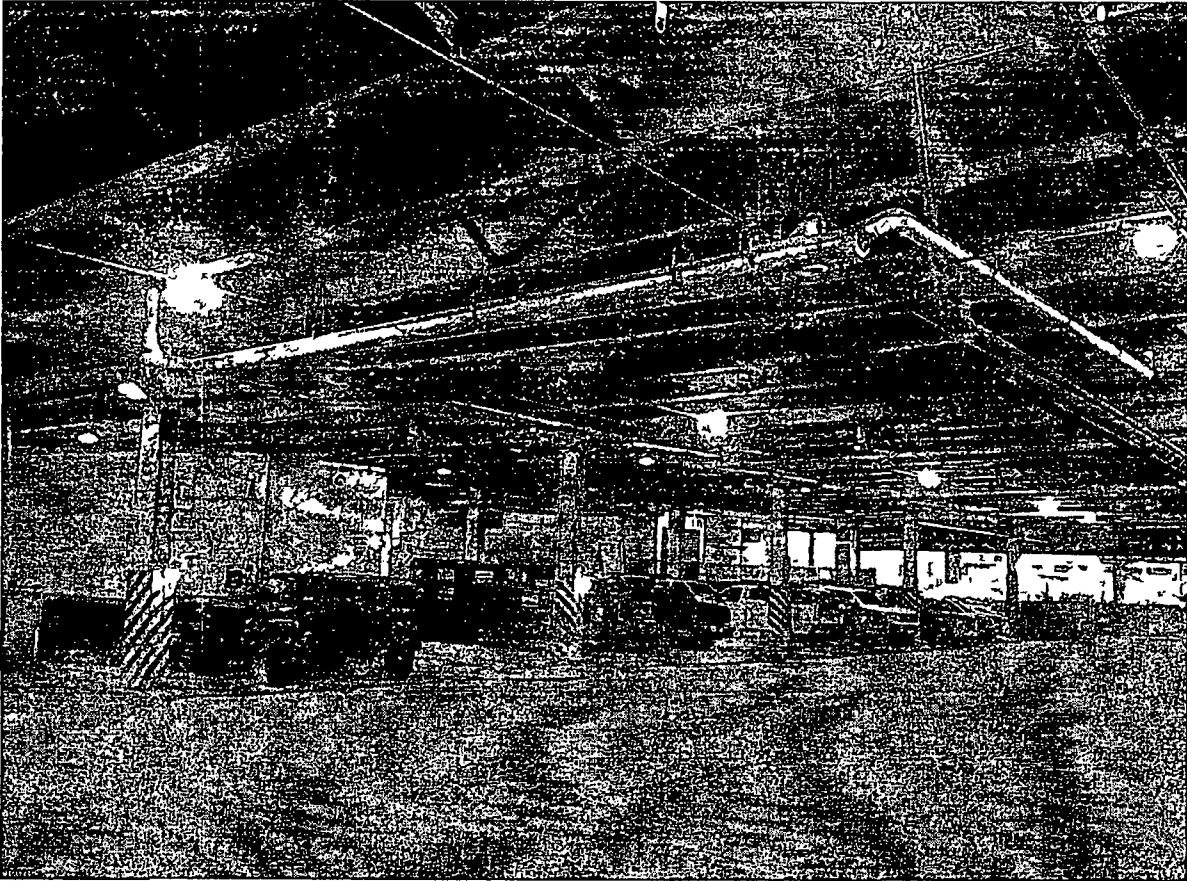
E North Water St (Lower) , east of N Michigan Avenue (Lower), looking east and north