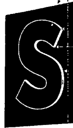
CABINET FACE LETTER DETAIL