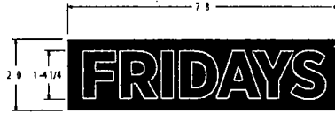
FRONT VIEW SCALE: A=1/0