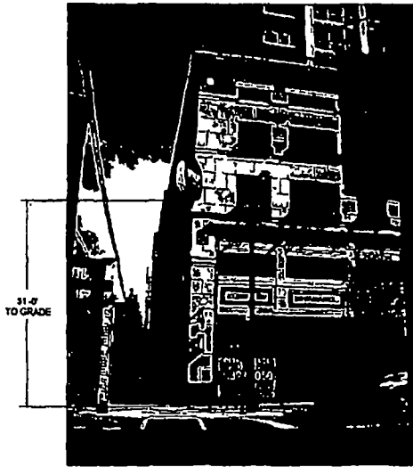
W ERIE STREET FACING NORTH

ACCT #356984-1 UNION RESTAURANT LLC d/b/a UNION SUSHI + BARBEQUE BAR 230 W ERIE STREET 1ST & MEZZANINE CHICAGO IL 60654