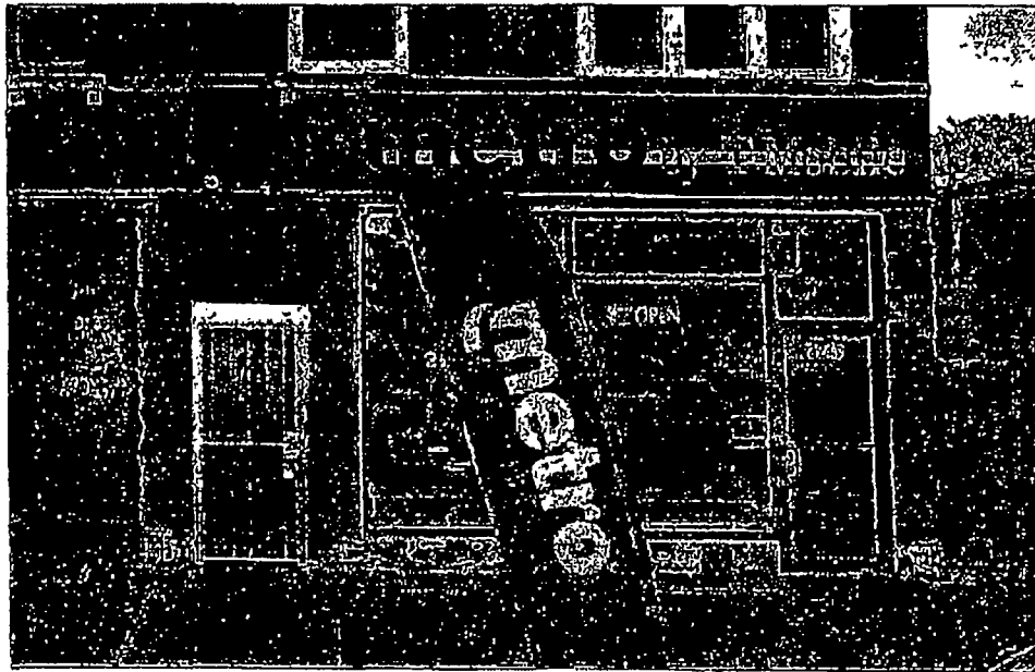
PHOTO ENHANCEMENT - SIGN A