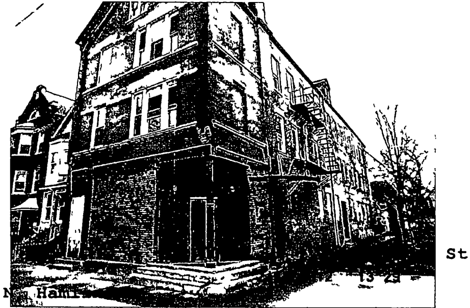
N Hamlin Ave Concrete Step Servicing Exit Staircase