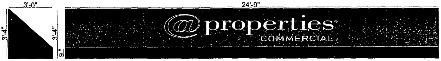
AWNING A FRONT VIEW QTY 1