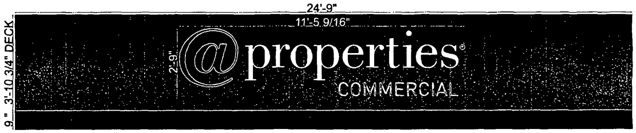
AWNING A UNDISTORTED DECK VIEW QTY 1

PROPERTIES CHICAGO, IL SOUTH WATER SIGNS 100592