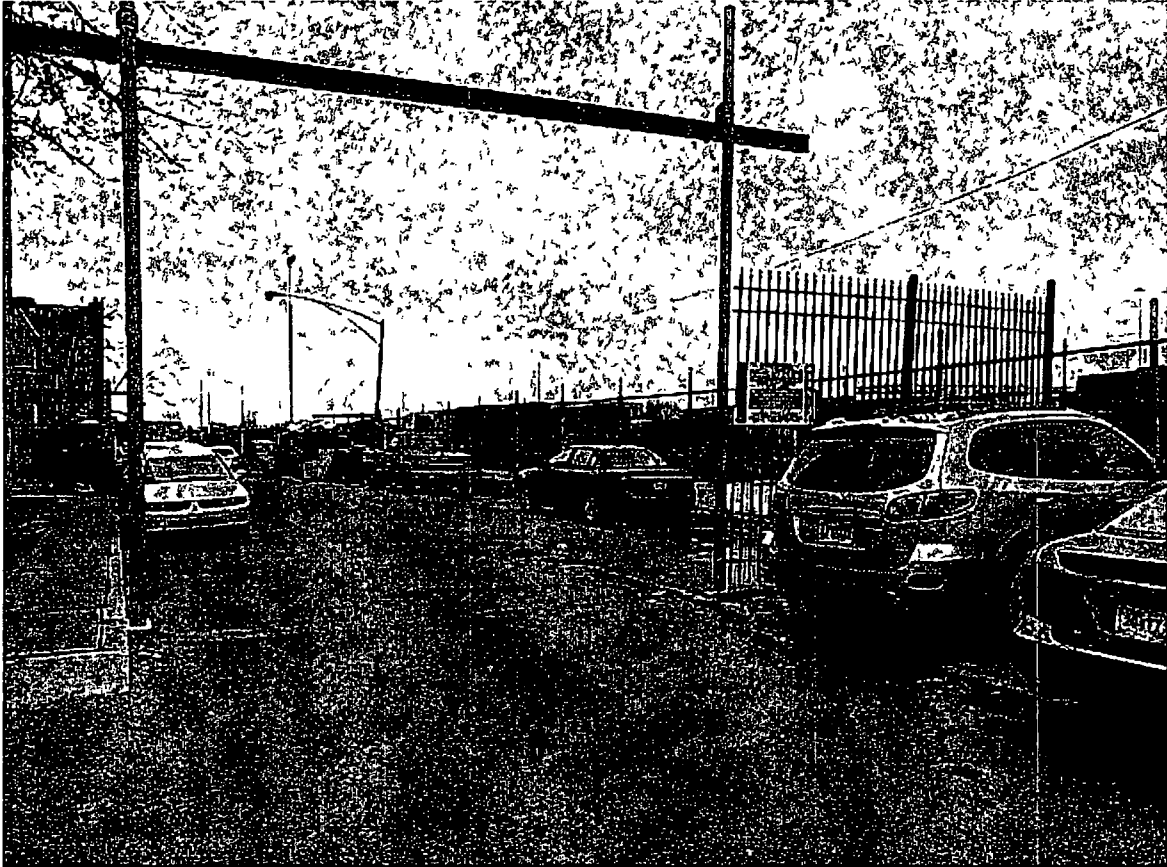
Area of new security gate looking south