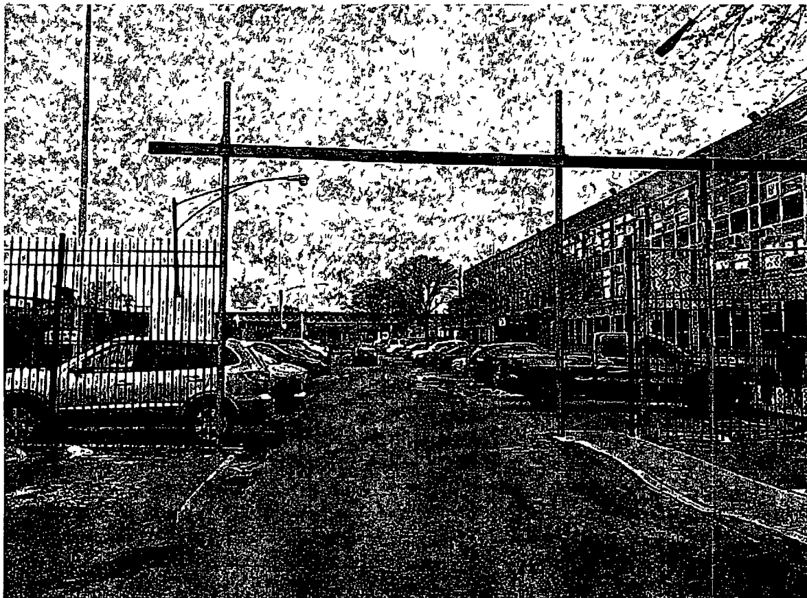
Area of new security gate looking south