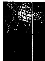
EXISTING ELEVATION SCALE HTS