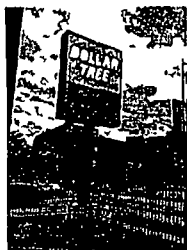
EXISTING ELEVATION HT