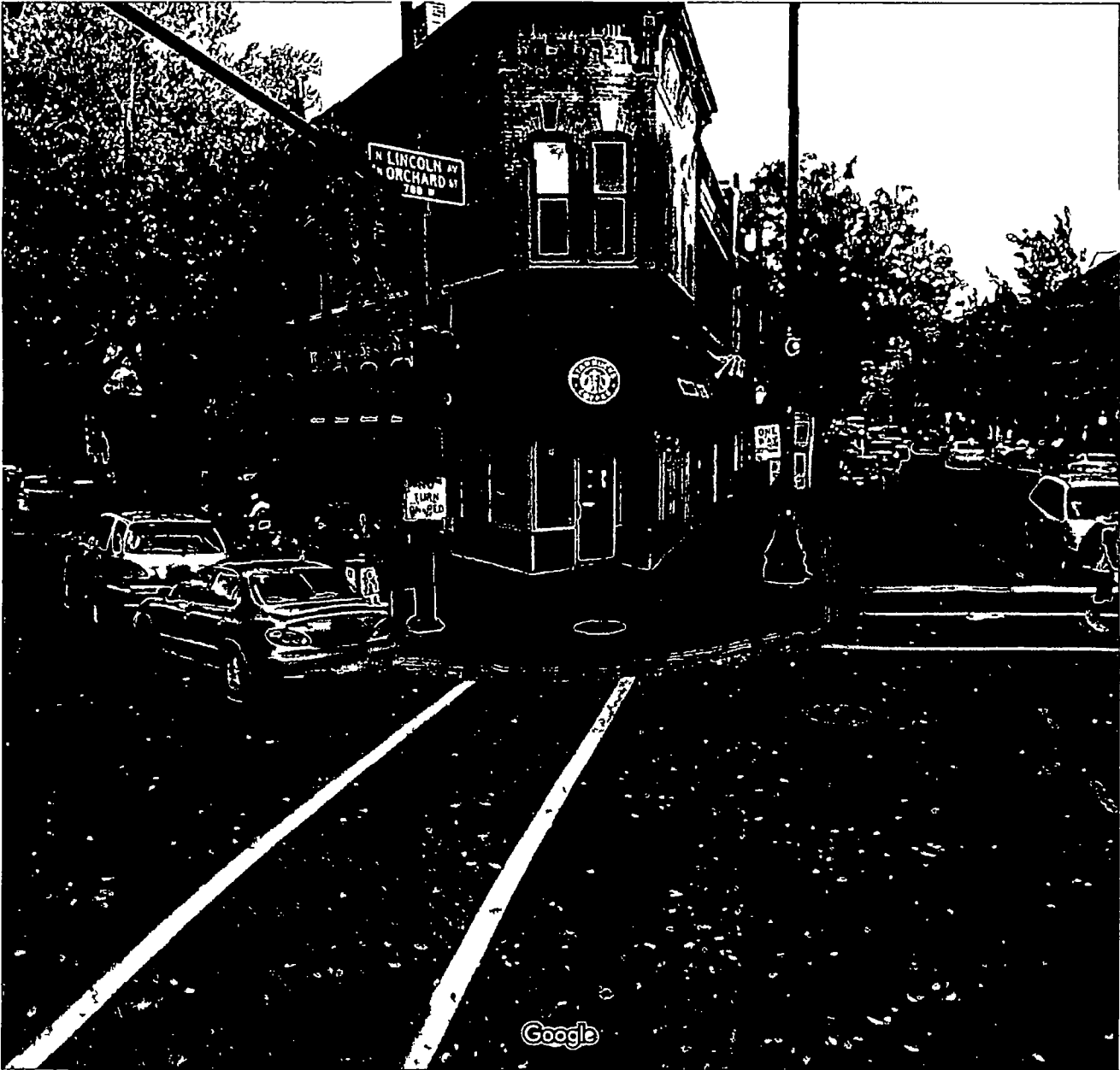
Chicago Illinois Street View Oct 2015