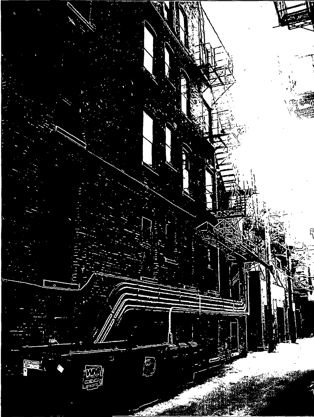
PHOTO 2: FIRE ESCAPE- VIEW FROM WEST FULLERTON PARKWAY LOOKING SOUTH AT ALLEY