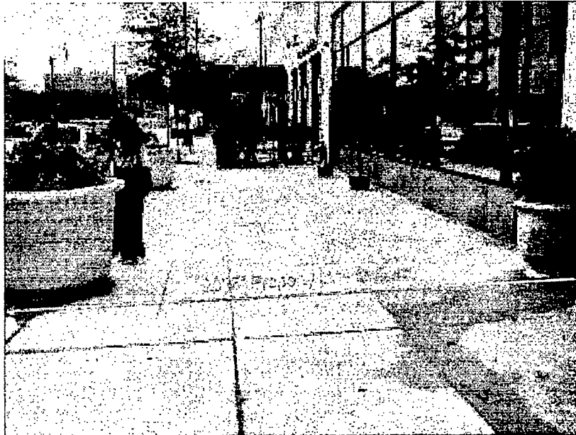
Side View Looking South