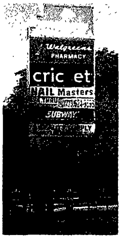
Existing - N.T.S.

▶ ONE DOUBLE FACE PYLON SIGN/ INTERNALLY ILLUMINATED/ MAIN ID CABINET IS ROUTED ALUCOBOND BACKED WITH DAY NIGHT PLEX/ TENANT CABINETS WITH WHITE LEXAN FACES WITH APPLIED TRANSLUCENT VINYL/ FABRICATED ALUMINUM CORNICE/ NON-ILLUMINATED REVEALS AND POLE COVER/ REMOVE EXISTING CABINETS AND USE EXISTING PIPE AND FOUNDATION