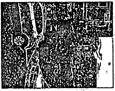
3 Aerial View of Site

ADDITIONAL STATEMENTS: ALL PLANTS ARE QUANTITIES AND QUALITIES FOR THE PROJECT AND ARE NOT TO BE USED FOR ANY OTHER PROJECTS. ALL PLANTS ARE QUANTITIES AND QUALITIES FOR THE PROJECT AND ARE NOT TO BE USED FOR ANY OTHER PROJECTS.