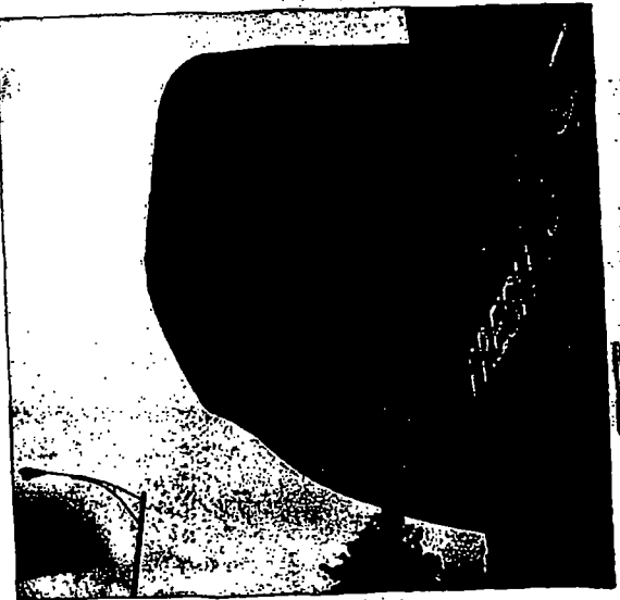
2422 W. MARQUETTE