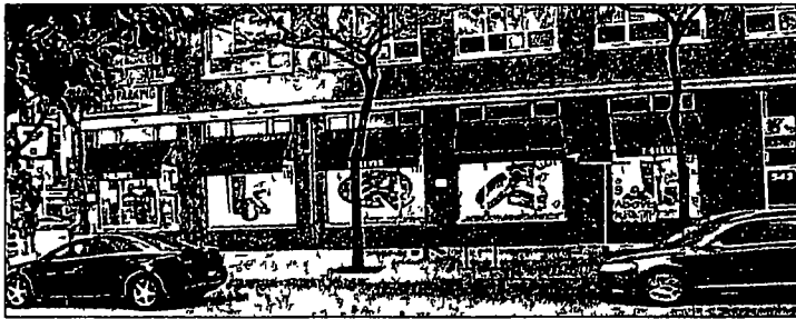
ST CLAIRE STREET ELEVATION