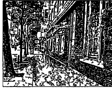
ST CLAIRE STREET ELEVATION