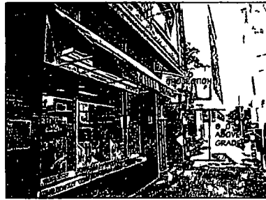
OHIO STREET ELEVATION