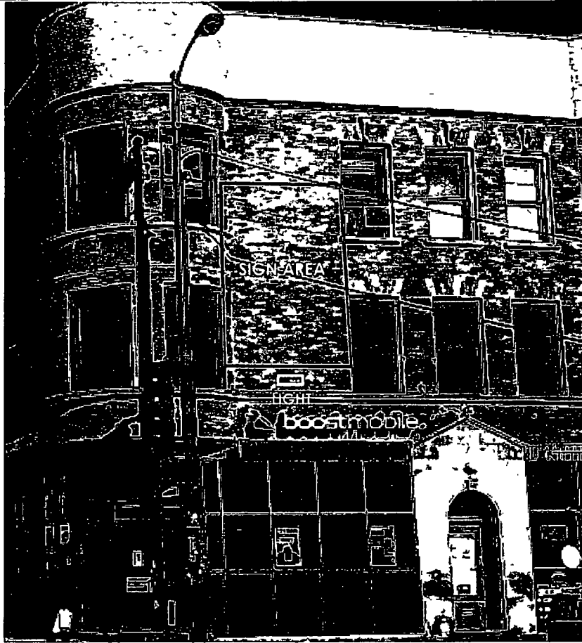
South Wall Depicting Sign & Light

Property Address 2358 West Chicago Ave – Public Way Use – Sign PWU Permit #