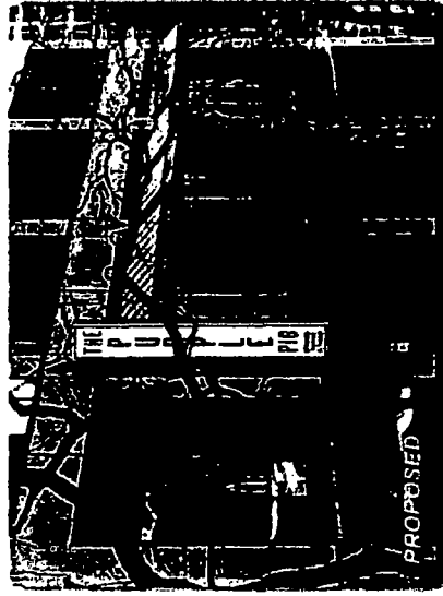
North Building Elevation - AFTER