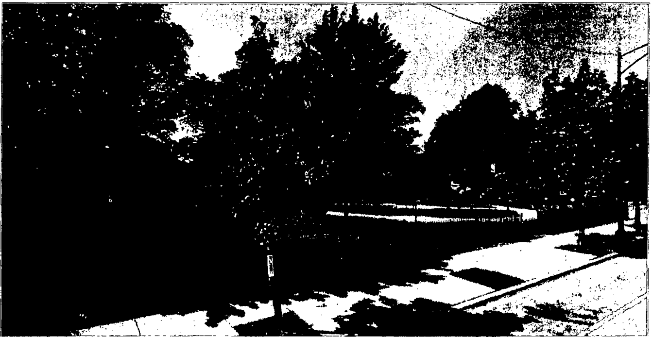
Site Photograph