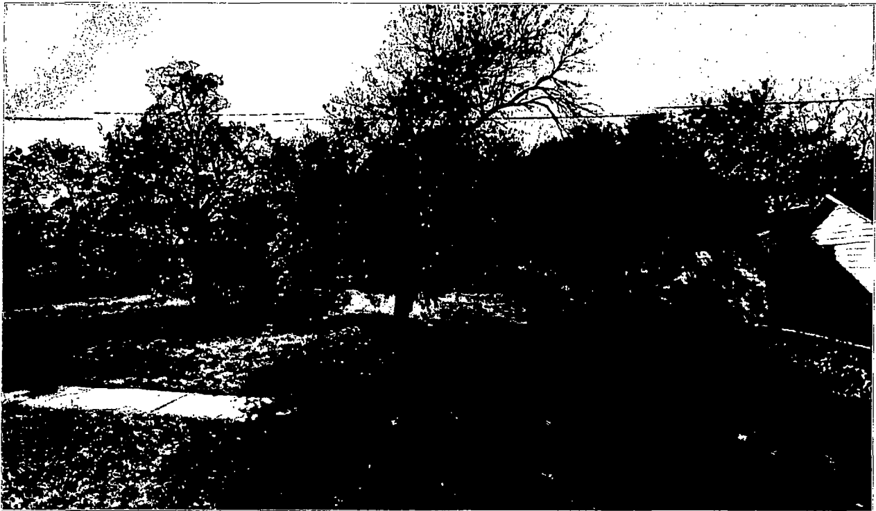
Site Photograph