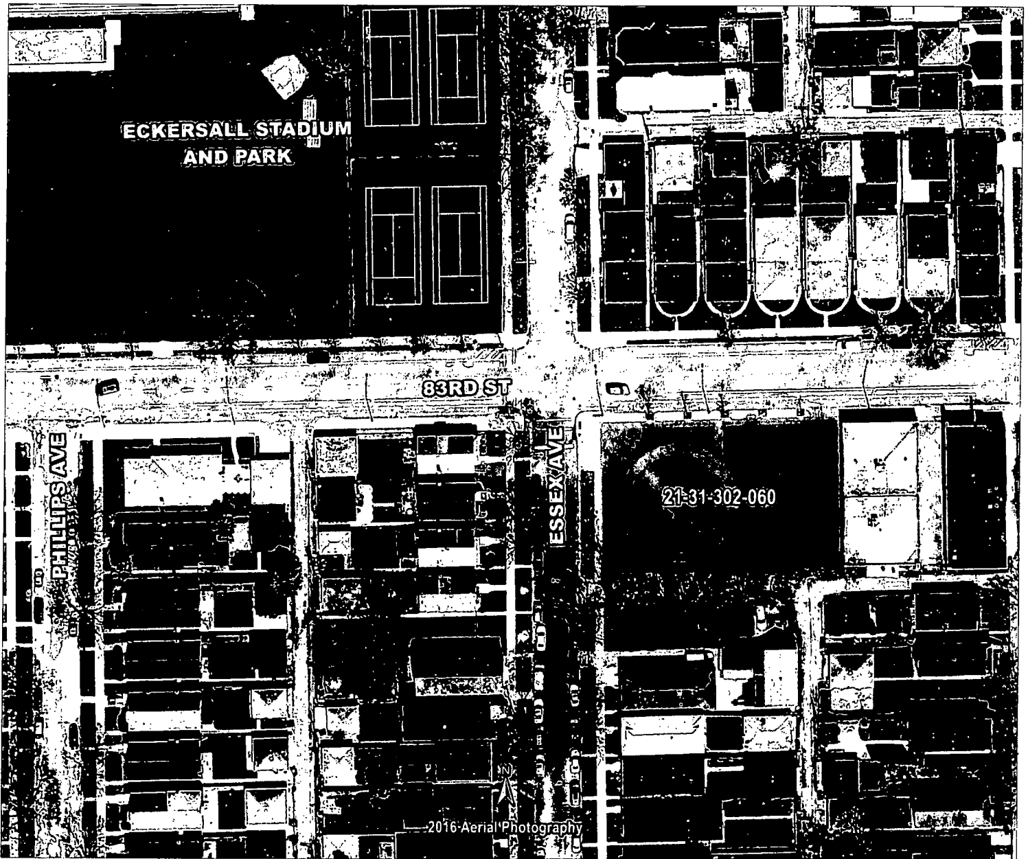
Enhanced Aerial Photograph

2501-2515 E. 83rd Street (PIN 21-31-302-060)