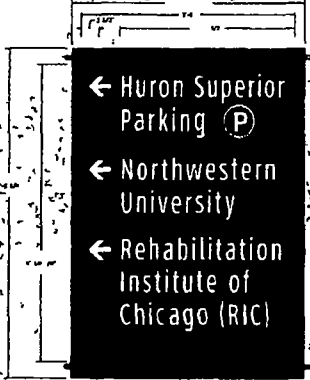
Panel Layout Scale 3/4" = 1'-0"

Ground plan and panel dimensions to be verified by fabricator before fabrication. Verify panel dimensions before fabrication on the ground.