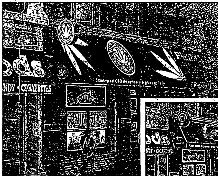
Proposed (image for reference purposes only) Rendering not scaled

Site survey needed to get exact measurements