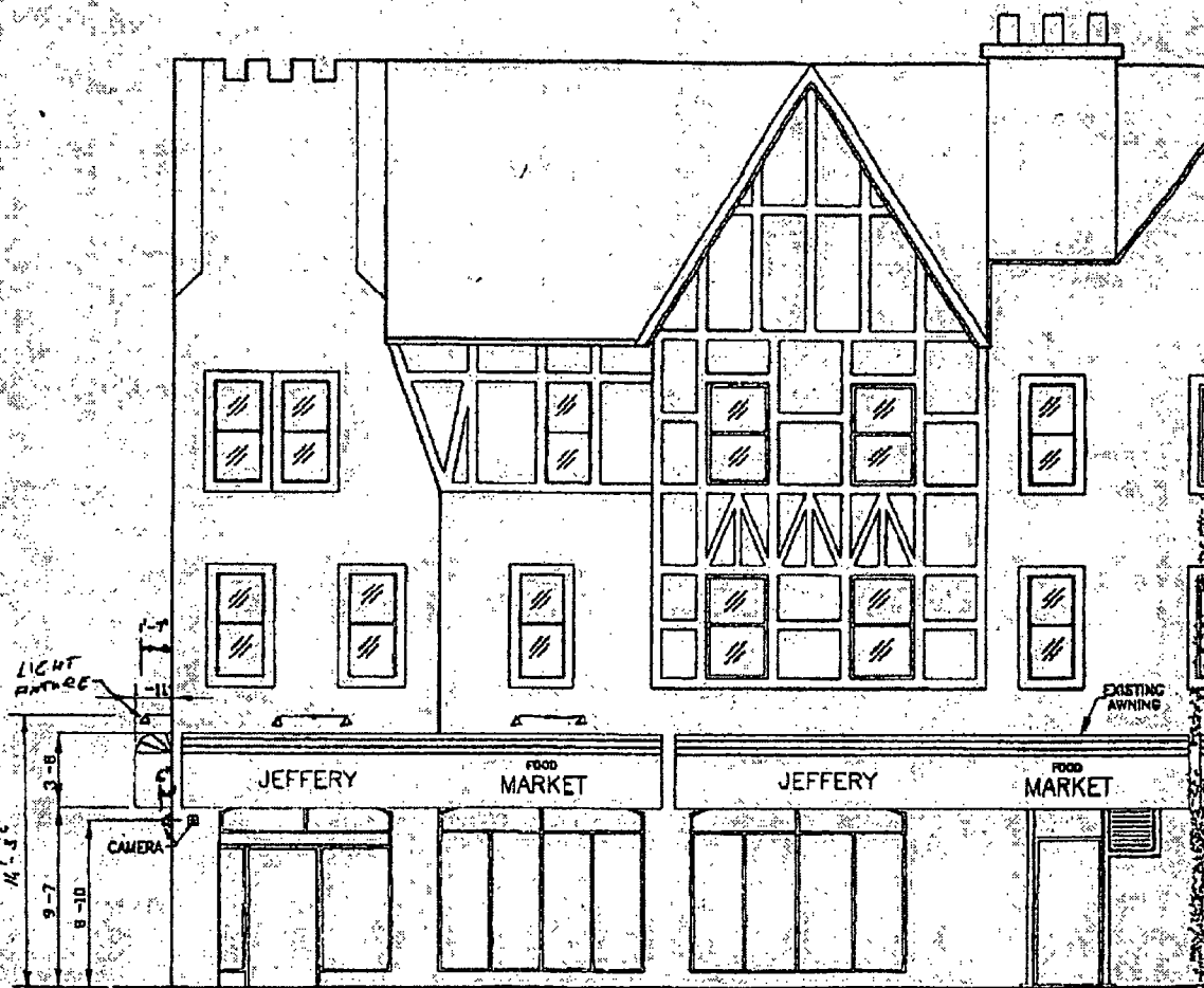
EAST ELEVATION SCALE 1/8" = 1'-0"