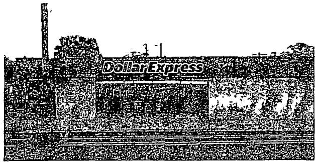
SOUTHWEST (FRONT) ELEVATION AFTER

57" SIGN BAND ↑ 12' (grade to bottom of sign) ↓