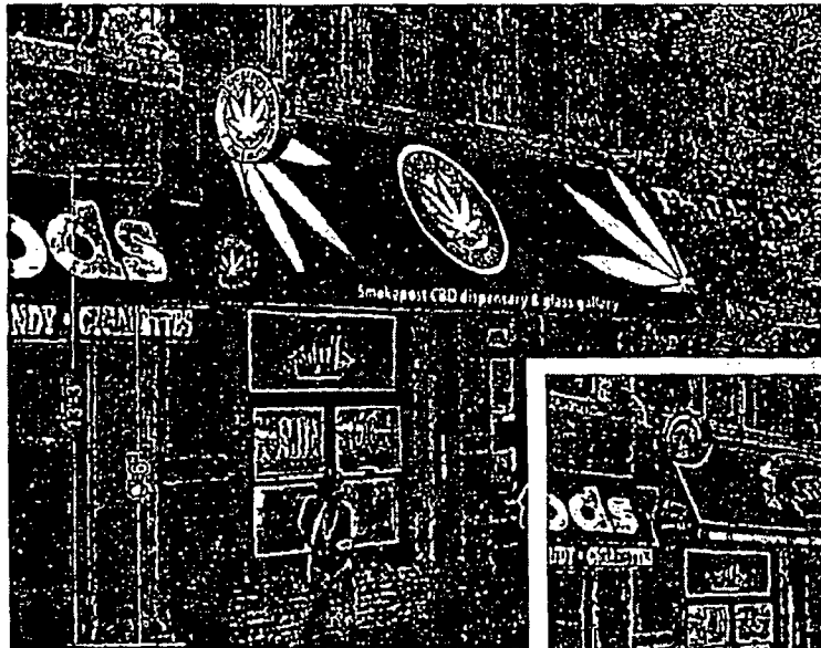
Proposed (image for reference purposes only) Rendering not scaled

Site survey needed to get exact measurements