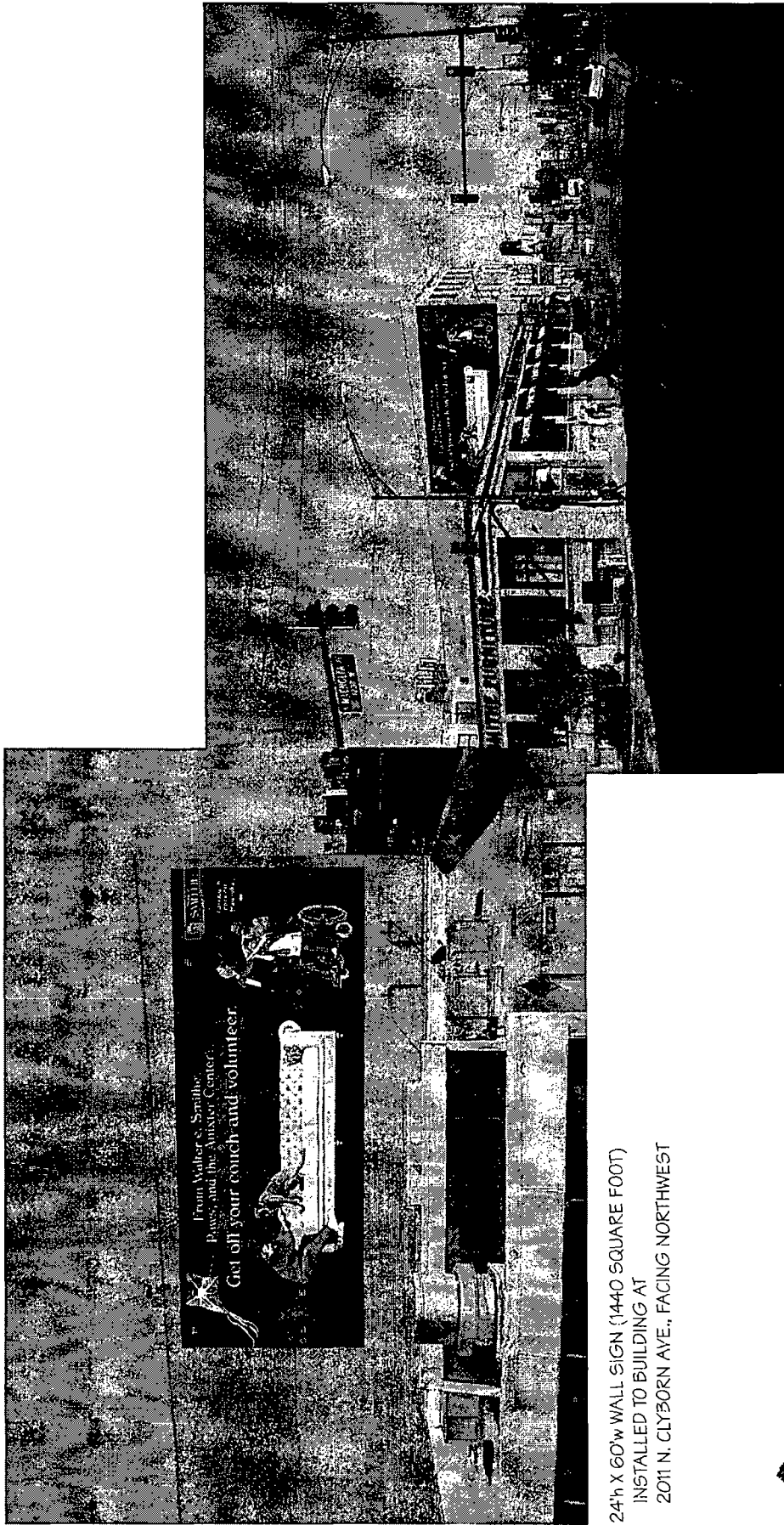
24'h X 60'w WALL SIGN (1440 SQUARE FOOT) INSTALLED TO BUILDING AT 2011 N. CLYBORN AVE., FACING NORTHWEST