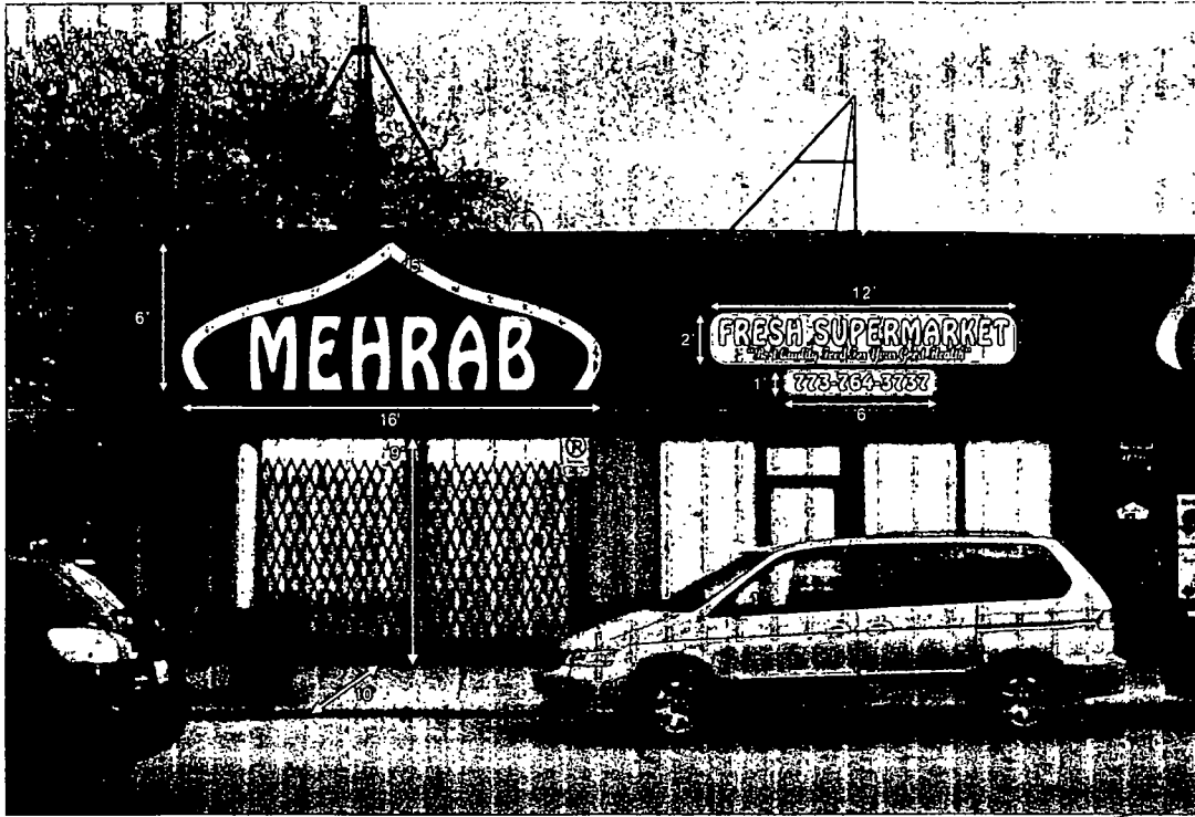
Raceway Channel Letters - Front view