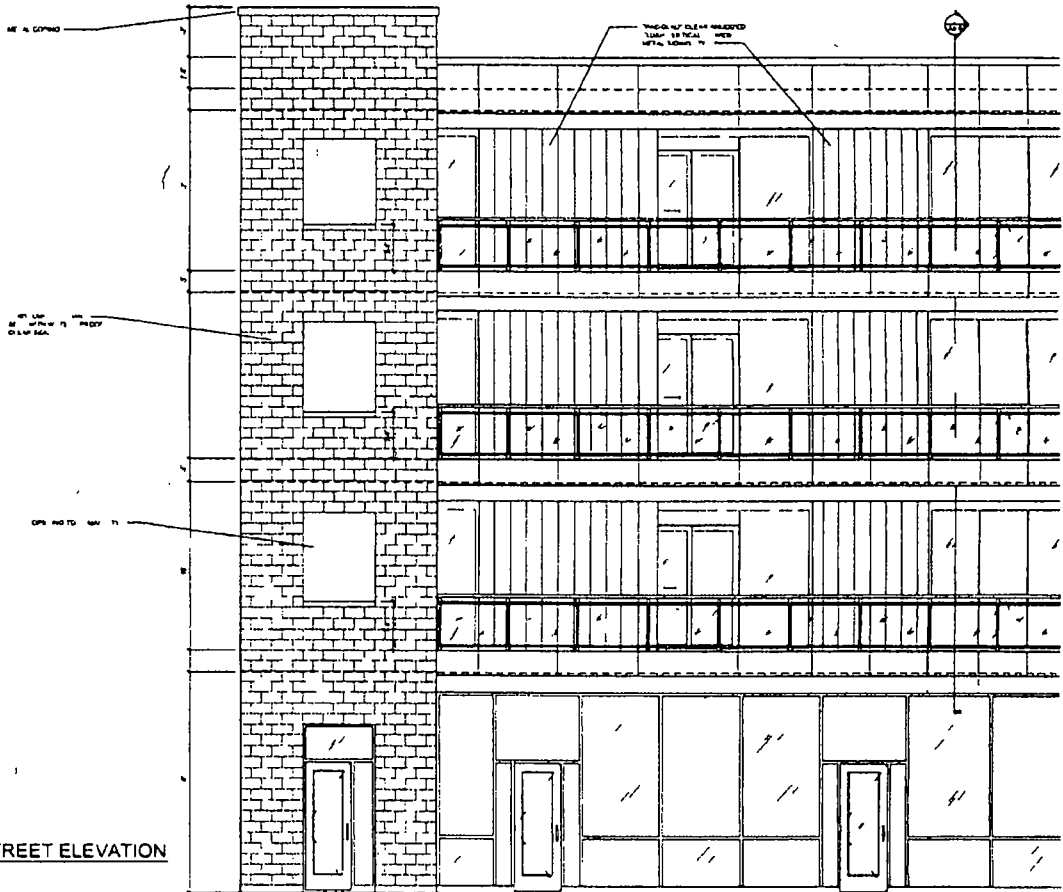
2 DIVISION STREET ELEVATION 1/4" = 1'-0"