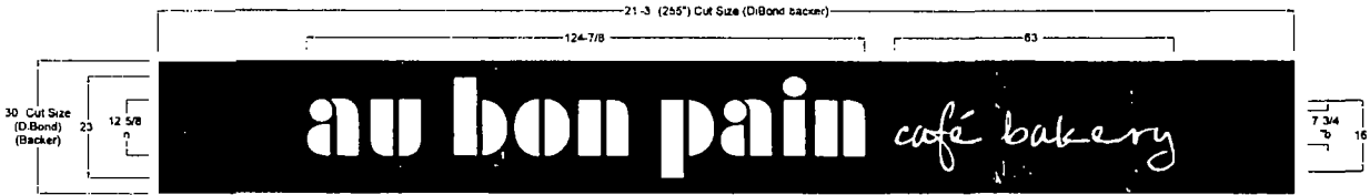
E1 Front Elevation View (Option C) #3237.1 (Qty: 1) Set of 1/4" Flat Cut Graphics with Painted DIBond Backer Panels Affixed to Architectural Facade via Pin Mounting and Adhesives