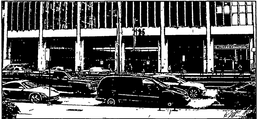
PE Photo Elevation View (Proposed Option I) Not To Scale

Colors: Backer Panels Painted Dark Bronze (TBD) Letters Painted White (sent)