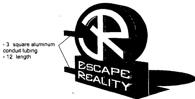
A S F Illuminated Blade Sign • Front/Side

Switch will have a dimmer installed and will only operate during store hours Internally illuminated cabinet built to UL specifications