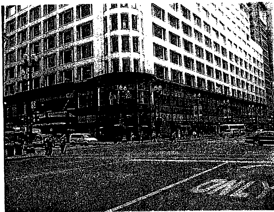
East Madison & South State Street Cast Iron Cornice