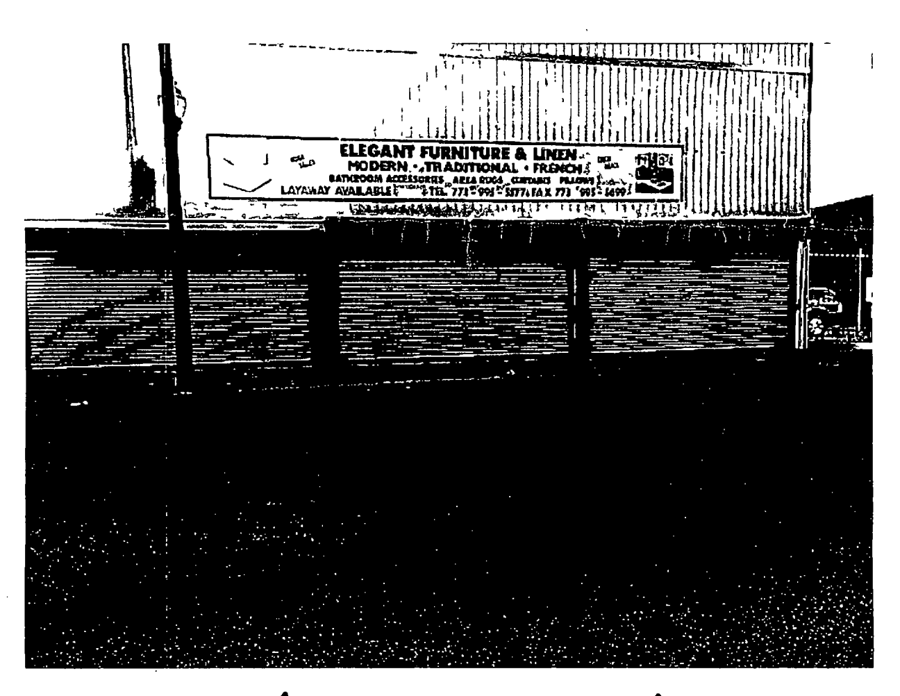
Elegant Furniture 11241-45 S. MICHIGAN ave CHICAGO