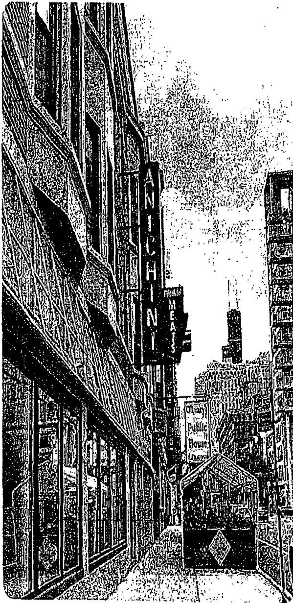
Plans and Dimensions of Existing Sign