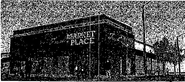
SOUTH & EAST ELEVATION WESTERN AVENUE FRONTAGE