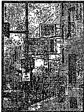
NORTH-WEST VIEW ON LINCOLN AVENUE