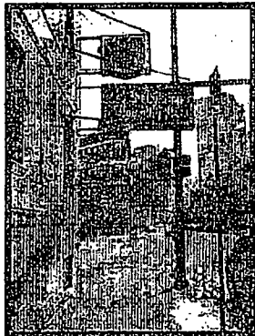
SOUTHEAST VIEW ON LINCOLN AVENUE