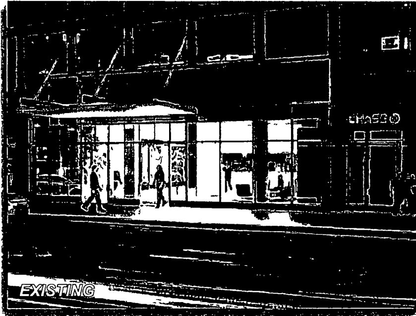
South Street View Elevation - Before