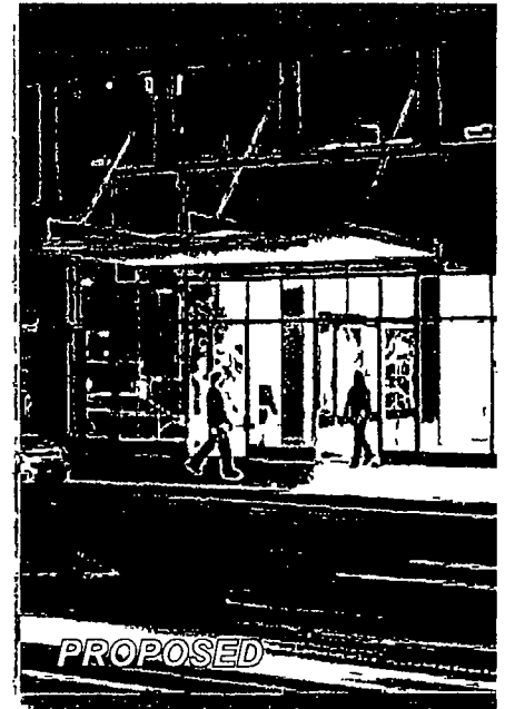
South Street View Elevation - After