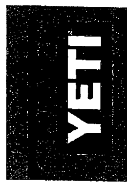
Night View - Scale: NTS

Square Footage 1'-0" x 3'-0" = 3.00 sq. ft.