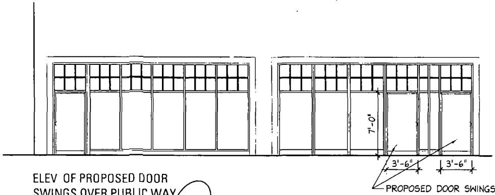
ELEV OF PROPOSED DOOR SWINGS OVER PUBLIC WAY