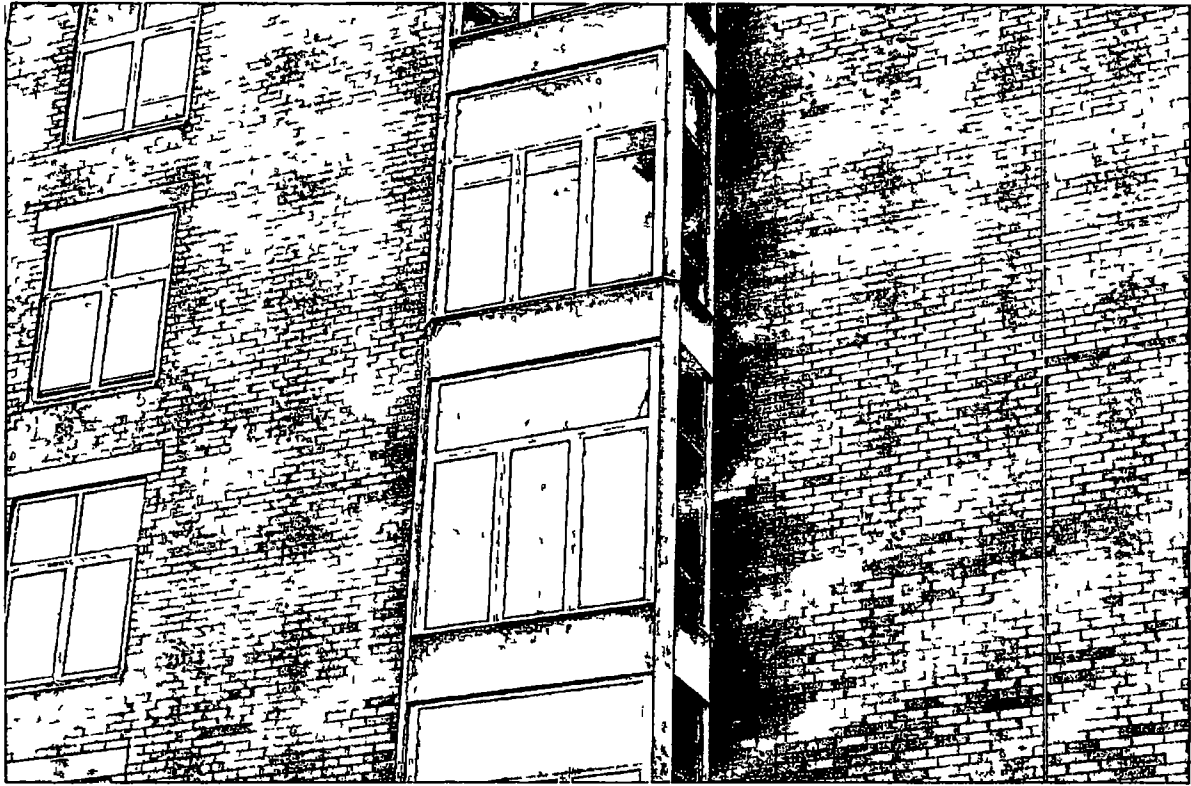
494 west elevation