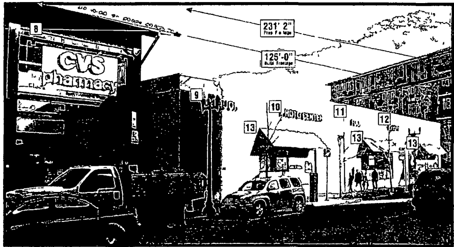
Proposed Signage West Elevation