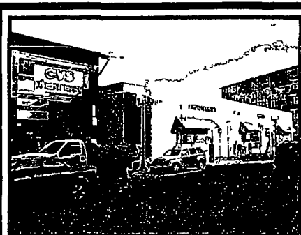
Existing Signage West Elevation