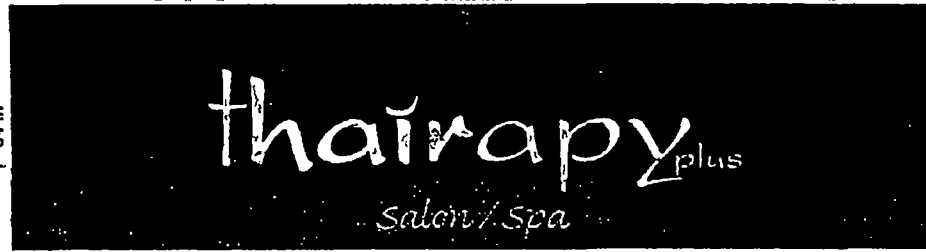
APPROXIMATE SIZE OF AWNING HYPOTENUSE LAID FLAT