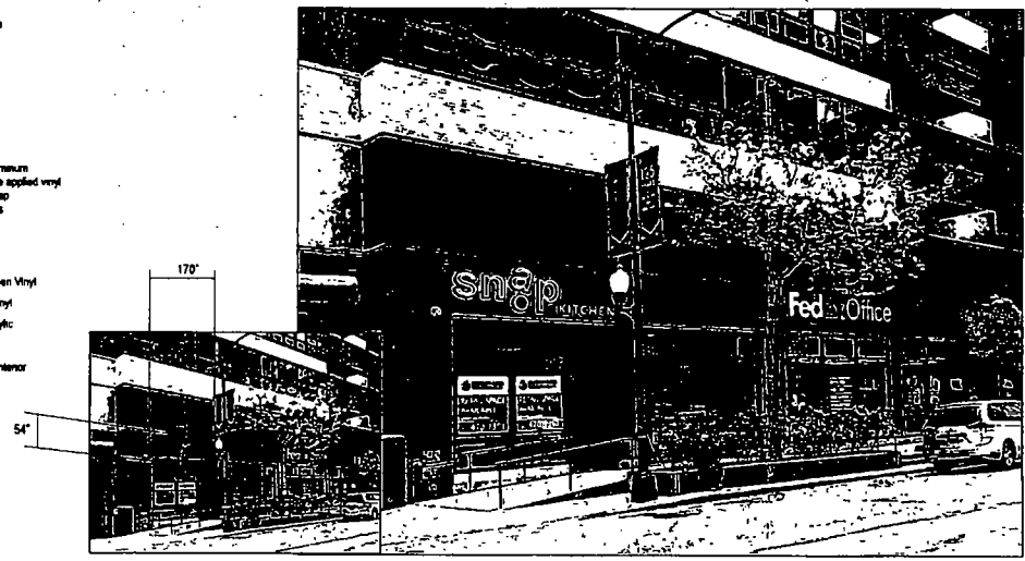
EXISTING CONDITIONS | NTS

COLOR SCHEDULE 3M 3630-136 Translucent Lime Green Vinyl 3M 3630-44 Translucent Orange Vinyl Kitchen Letters 2447 LD White Acrylic Juvetite Standard Black Pre-Finished Black Exterior/White Interior