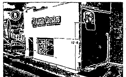
South Elevation (Rear)