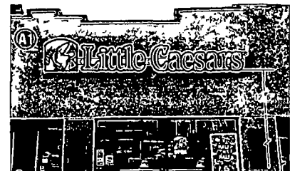
North Elevation (Front)

FURNISH & INSTALL TWO (2) NEW SETS OF 26" HIGH LOGO & 28" HIGH LITTLE CAESARS RACEWAY MTD. LETTERS INSTALL ON THE FRONT & SIDE ELEVATION FURNISH & INSTALL ONE (1) TILTMAN LOGO ON THE REAR ELEVATION (LEFT ALIGNED TO MAINTAIN MAX. VISIBILITY) COMPLETE HOOKUP TO THE EXISTING 120V PRIMARY SERVICE WITHIN 5 FT. OF EACH SIGN LOCATION