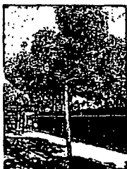
TREE NO 1