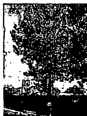
TREE NO 2