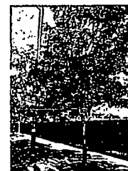
TREE NO 6