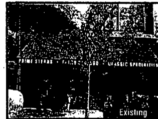
True Brown Sunbrella awning fabric attached with matching trim. Awning valance decorated w/ heat transferred graphics to match 3M #7725-99 Fawn. 1" thick stripes are spaced 3" from bottom of valance.