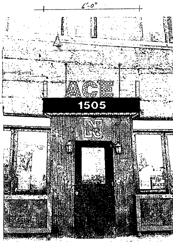
OVER FRONT DOOR

2 AIRCRAFT CABLES FROM TOP OF SIGNAGE CANOPY TO BUILDING