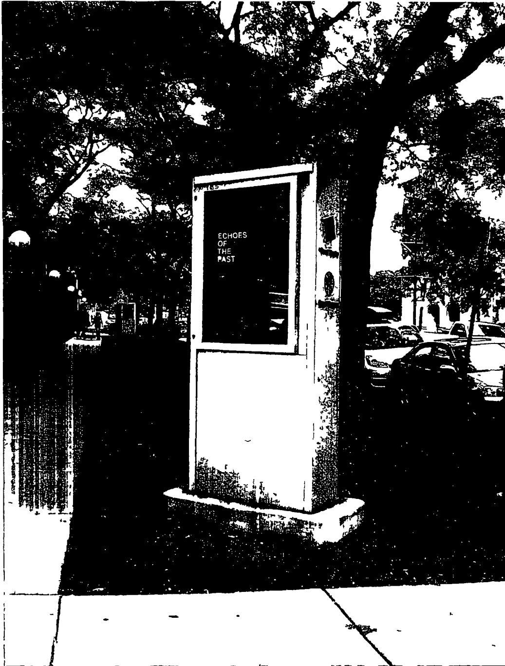
East 56th Street and South Greenwood Avenue Dimensions 3' 3 1/2" X 8' 0" X 1' 5"