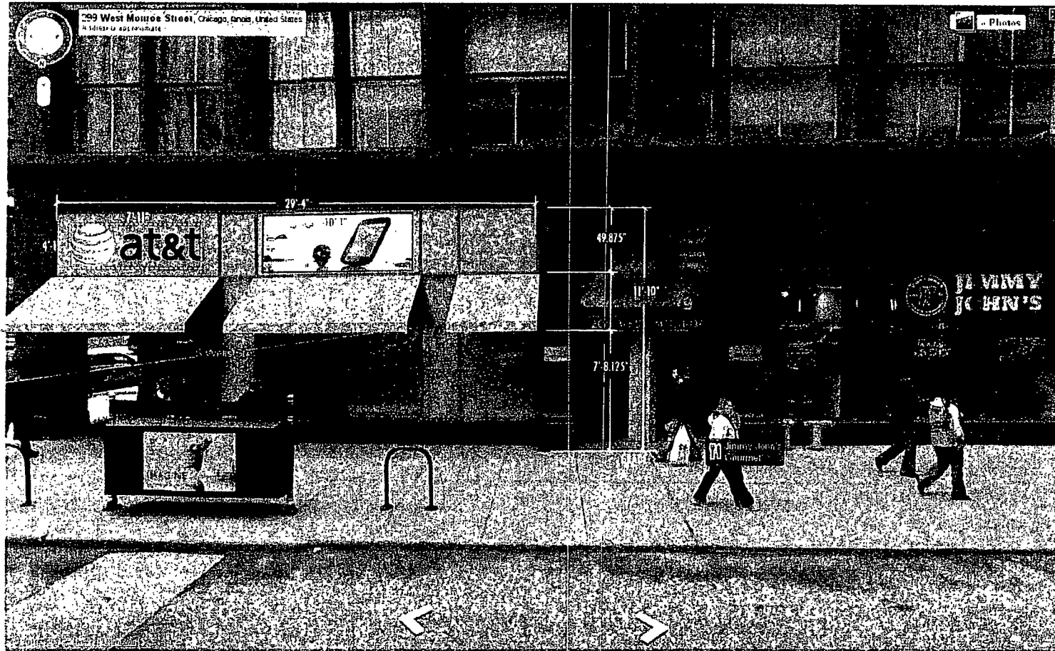
MONROE STREET BUILDING ELEVATION SCALE: N.T.S.