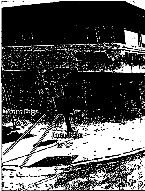
West Elevation All Lights are same size